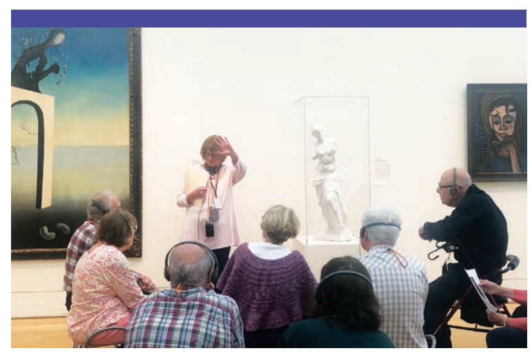
An Art Institute employee leads an Art in the Moment discussion of Dali's Venus de Milo with Drawers